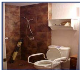
Bathroom after HISA

A $6,800 lifetime benefit may be provided to Veterans and Servicemembers or a service-connected condition or a non-service connected condition rated 50% or more for a service-connected disability.